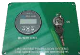
BMV 700 Intelligent Display

System ON/OFF & direction switches with battery display. stainless steel back plate