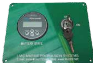
BMV 700 Intelligent Display

System ON/OFF & direction switches with battery display. stainless steel back plate